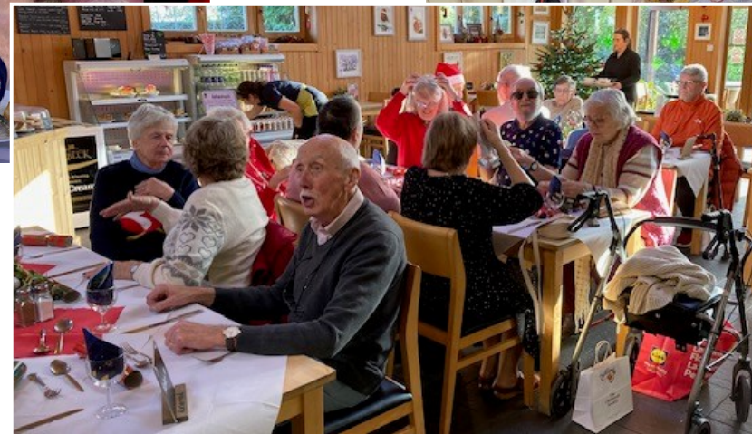
Christmas cheer at the Wool community lunch.