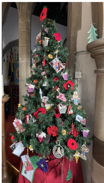
Some images of the Holy Rood Christmas Tree Festival