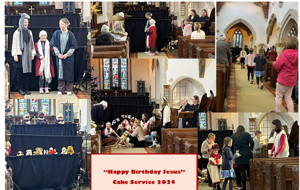
Last Sunday was the Cake Service at Bere Regis.