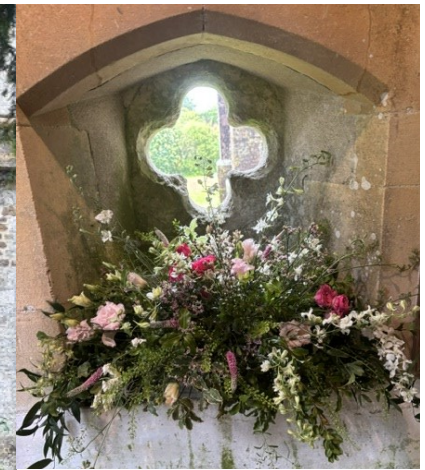
HOLY ROOD DECORATED FOR A WEDDING 6th June (Flowers by Diana Pinney)