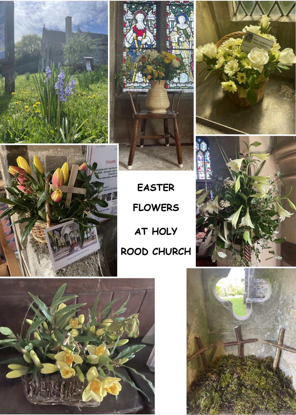
EASTER FLOWERS AT HOLY ROOD CHURCH