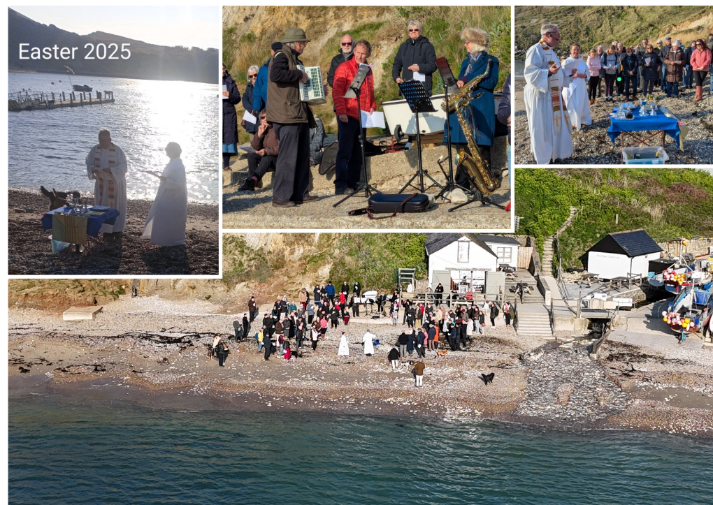
The early morning sun shone on the Easter Communion service at the Beach, Lulworth Cove. The top picture appeared in the Daily Telegraph.