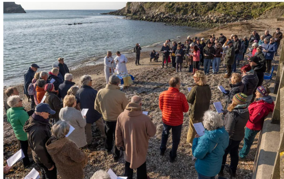
People gather for an alfresco Easter Sunday church service at Lulworth Cove, in Dorset